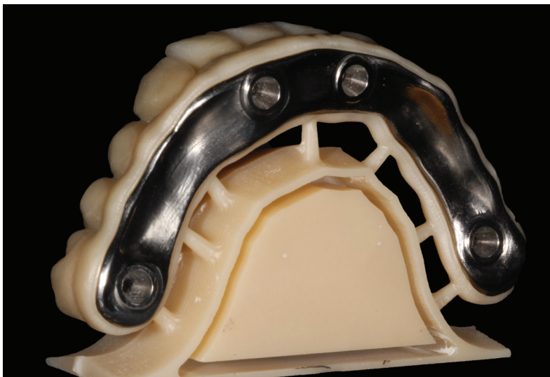
Figure 2. Zirconia superstructure coupled to the titanium bar (Mdt Germano Rossi). In this case, the bar was made of grade 5 titanium Rematitan 5 (Dentaurum s.p.a) while zirconia Ceramotion Z Hybrid 1300/1020 Mpa (Dentaurum s.p.a) was chosen for the superstructure.