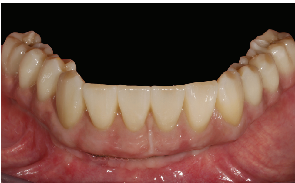
Figure 3. Case concluded: gingival and dental aesthetic ceramization with Ceramotion One Touch ceramic pastes (Dentaurum s.p.a).